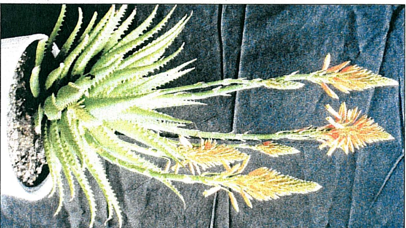
Gemini: Prune for ball shape.