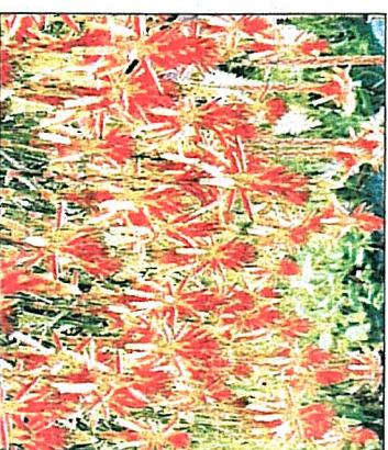
Topaz: Good for mass-planting.