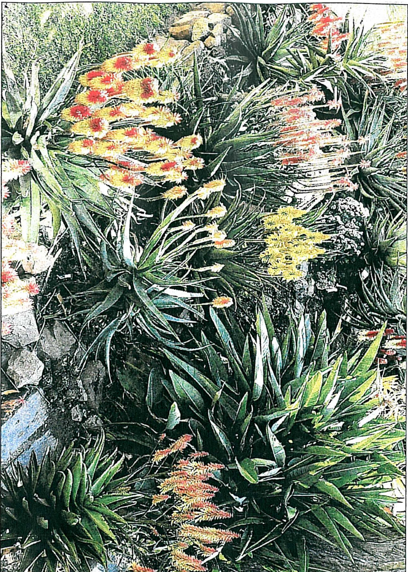
Variety: Using different forms, you can get flowers from February to November.