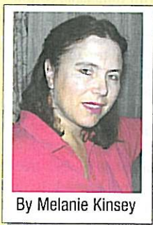
By Melanie Kinsey

I planted an Aloe arborescens X ferox in the corner of one dry bed in my garden and it produces tall spikes of red flowers in winter.