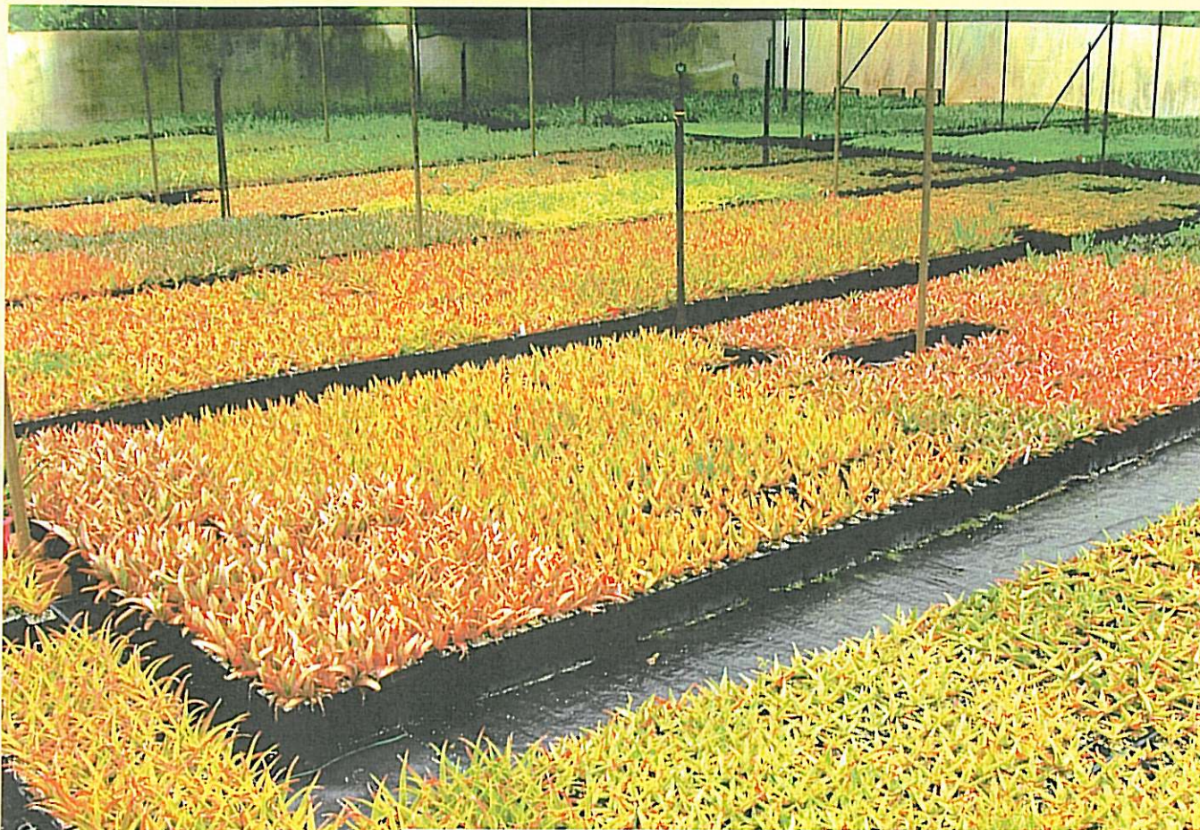
Aloe-Aloe hybrids display their vibrant colour and (inset) their striking form that's sure to impress in any garden.